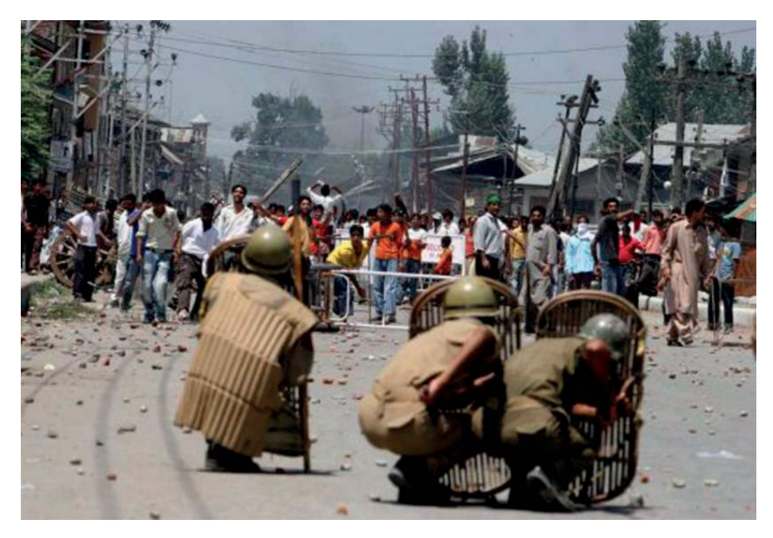
Indian policemen and a stone-throwing crowd, Srinagar, 2008

(c) There have been increased attempts to solve the Jammu and Kashmir issue since the Kargil Incident of 1999. Is it becoming easier or harder to resolve the dispute? [12]