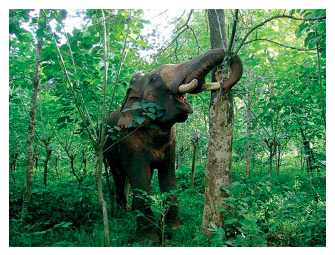
Elephant in a forest in Karnataka, 2009

(b) Explain the environmental problems caused by the widespread destruction of trees and forests in the Indian countryside. [8]